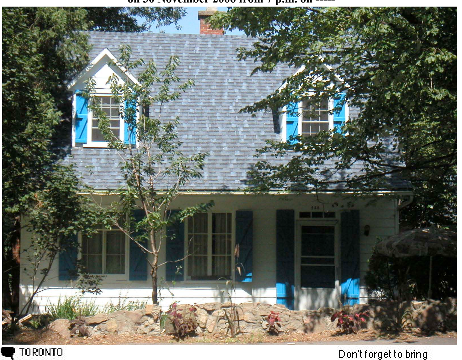
You are cordially invited to an end-of-course party at my Electronic Cottage on 30 November 2006 from 7 p.m. on -----