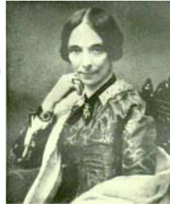
JANE WELSH 1801 - 1866